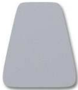
Blank anodized Aluminium

The originality of this Matrix amplifier consists of returning to the origin. This is reached by making the amplifier almost completely out of aluminium. Two finishes of this amplifier have proven their looks in the past and showing of this clear message of returning to the origin. Therefore the available colour options in the primary stock program are blank and black anodized aluminium.