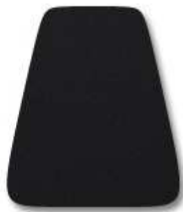
Black anodized Aluminium

* Colours shown only give an indication of the real colour, contact your dealer for references.